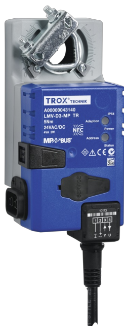
COMPACT CONTROLLER LMV-D3-MP-F