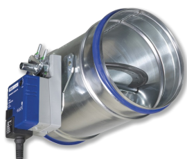
SHUT-OFF DAMPER, VARIANT AK, WITH ACTUATOR