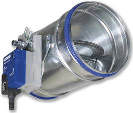
SHUT-OFF DAMPER, VARIANT AK, WITH ACTUATOR