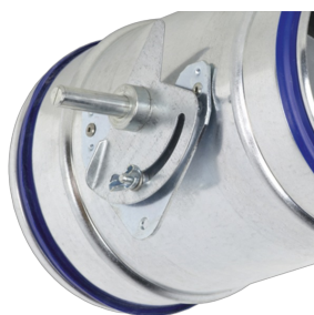
VARIANT FOR MANUAL OPERATION