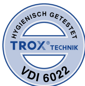
TESTED TO VDI 6022