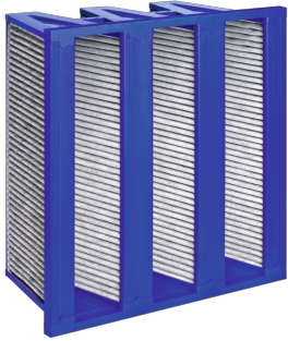
ACTIVATED CARBON FILTER INSERT, TYPE ACFI