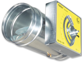
CAV CONTROLLERS TYPE RN-EX