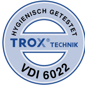
TESTED TO VDI 6022