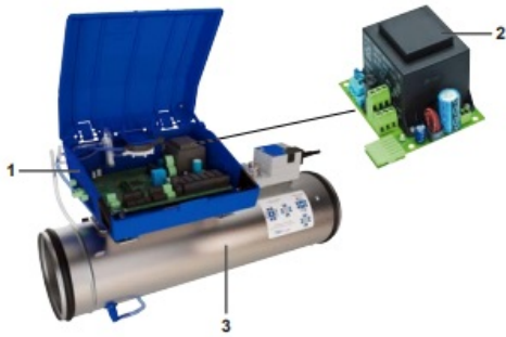
Volume flow controller TVR with EASYLAB control component 1 Controller TCU3 in housing 2 EM-TRF 3 Volume flow control unit