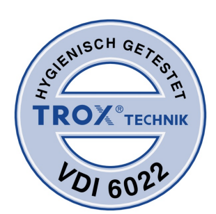
TESTED TO VDI 6022