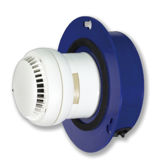
DUCT SMOKE DETECTOR RM-O-3-D