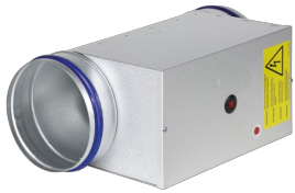
HEAT EXCHANGER TYPE EL