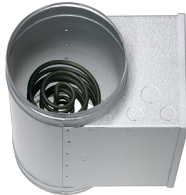
ELECTRIC AIR HEATER WITH PLAIN STAINLESS STEEL HEATING COIL

Electric air heater with plain stainless steel heating coil