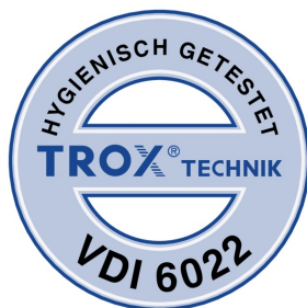
TESTED TO VDI 6022