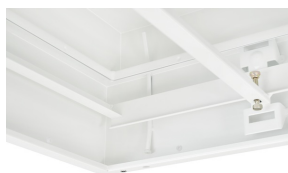
Internal measuring tube to sample particles for measurement