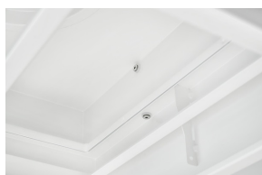
Pressure measurement point, detail