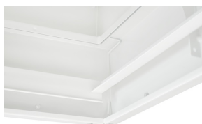
Test groove, detail