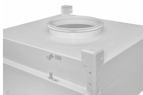
Circular spigot with lip seal